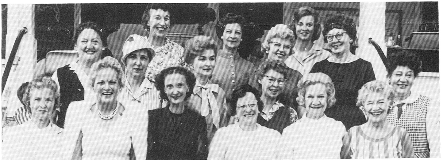
And A Wonderful Ladies Auxiliary (All Past Presidents)