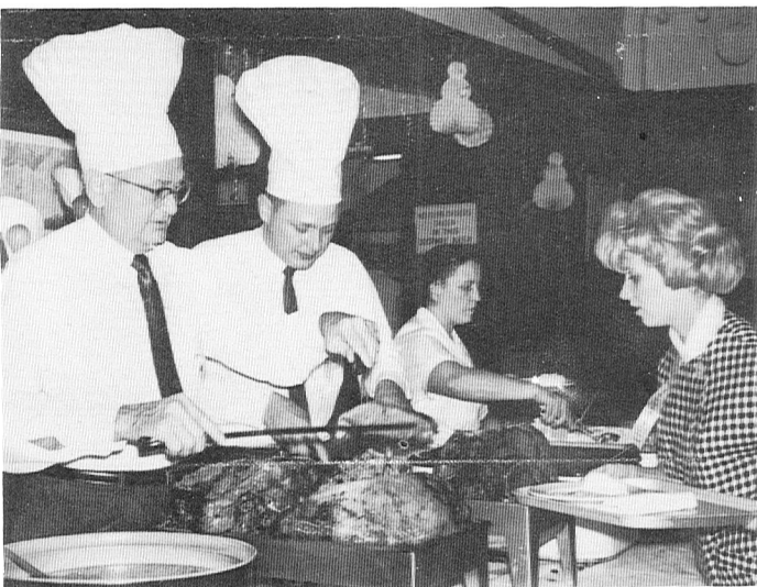
Ballengers & Their Beef