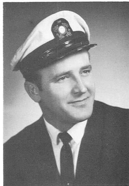
Gov. Don K. Downey Junior Program