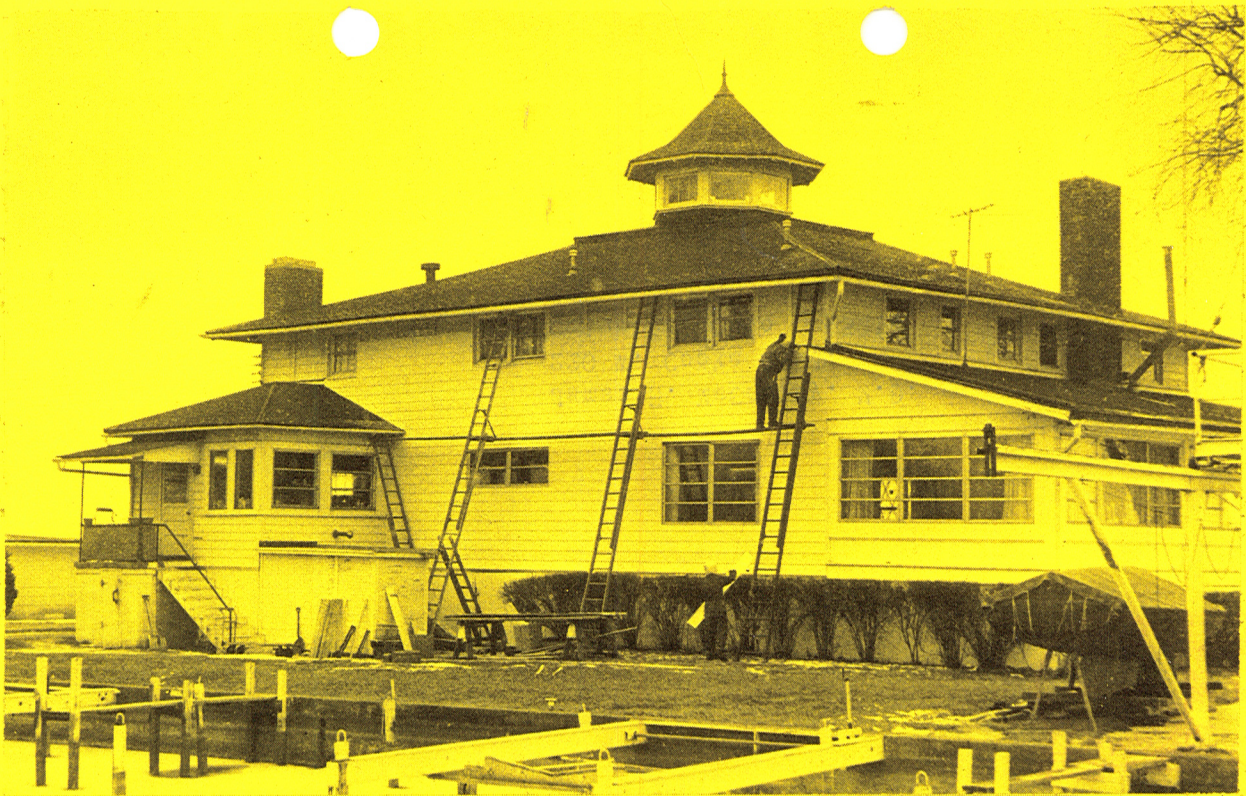
The Yacht Club now has an aluminum hull