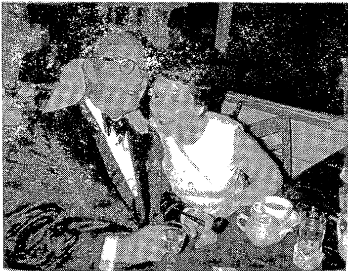
THAT'S THE WAY IT IS WHEN YOU'RE COMMODORE