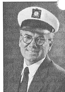
Governor Jim Fedor