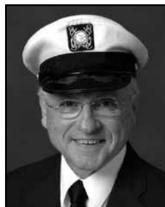
Governor Don Day

I did a second walk through of the storage yard and found just a few violations. They were: 1) space #32 is unrented; however, it contains a Chrysler sailboat (OH6172WD); 2) space #78 is unrented; however, it contains a Checkmate powerboat (OH8228ZW) and a Polaris waverunner (OH3831BM); 3) space #80 is unrented; however, it contains a Rinker powerboat (OH0502DT). There is also a "one-design" sailboat blocking spaces 48, 49 and 50 which are full. If you recognize an item that belongs to you please take steps necessary to correct these viola-