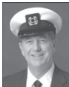
Governor Charles McClenaghan