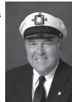
Governor John Sproat

There is no OSU game that day so its a natural for a party. You asked for Cass' return. He played a superb blues show at the pool last summer. He teams up with the