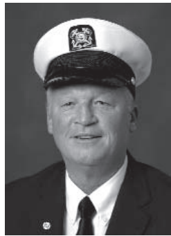
Governor Rick Myers

Greetings! Due to a number of pending requests, I am currently reviewing the files in an effort to accommodate our members, as well as update waiting lists for docks and storage. These will be posted in November. Therefore, please expedite your winter storage requests as well as spring dock requests. As the boating season ends, we have several openings in the Eastport Storage Yard. We are also contemplating the sale or removal of several boats that have been given to the club but are no longer used, to make more room for storage of member boats. In November, we will begin tagging boats or trailers that are not in a contracted location.