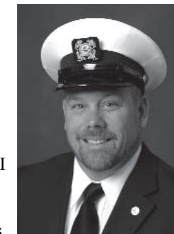
Governor Wes Cartwright