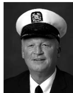
Governor Rick Myers

The lake is now at low pool. We will be addressing dock repairs as weather and budget permits. In early 2011 we will be reviewing dock requests. If you need a dock, a change of location or are aware of a needed repair on your dock, please contact me as soon as possible.