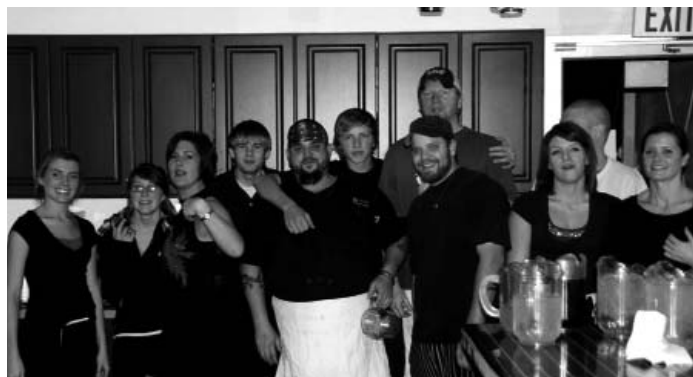
Happy New Year from Team BLYC. Come see us this winter!

I would also like to inform everyone on how our charging system works when you member charge your dinner or bar bill. The server or bartender must get the member's name AND number to start your table a tab in the computer system. Often times, when you are seated with other members, the name on the TOP of the check is what the server or bartender named the whole table in the computer system, however, the name at the bottom of the check, along with the member number, is, in fact, the member actually being charged. If a server types in the member's name to charge the bill and the member decides not to charge, it is a simple fix for the server to delete the name and take a cash or