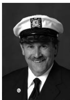
Governor Tim Ryan

Don't forget to send in your dues and continue your membership with BLYC what a great facility and value.