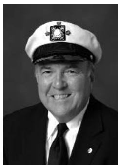
Governor John Sproat

Sunday, September 4, from 2-5 p.m. Our annual Harbor Lights Party is September 17. The featured entertainment is the very