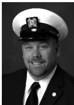
Governor Wes Cartwright