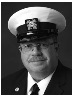
Governor Charles Wadley

It is time to remove your watercraft from the docks. The ODNR, Division of Parks, dock license expires as of November 1.