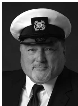
Governor Jerry Besanceney

We have great events, dining and entertainment so I am looking back in The Log at what we've done, such as a super productive and fun clean up day on October 16, the