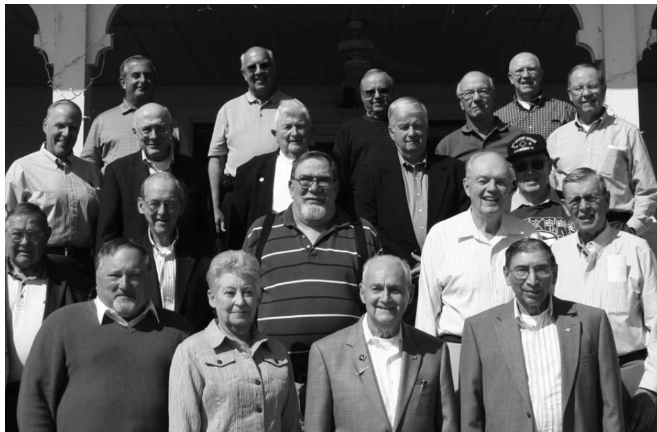
Former Senior Officers of the 83rd ARCOM lunch at the club on October 6. The Club did a great job off the menu and the group loved it. Don't forget the Club for your next event, especially for the holidays.