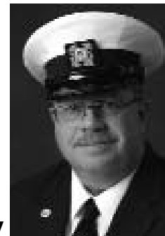
Governor Charles Wadley

boat hoist. All changes require prior approval.