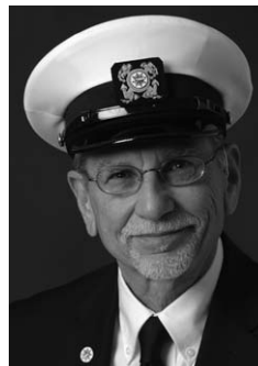
Governor Dave Luttenberger

Skippers Mtg. 1:30 (PHRF start 2, One design separate start.)