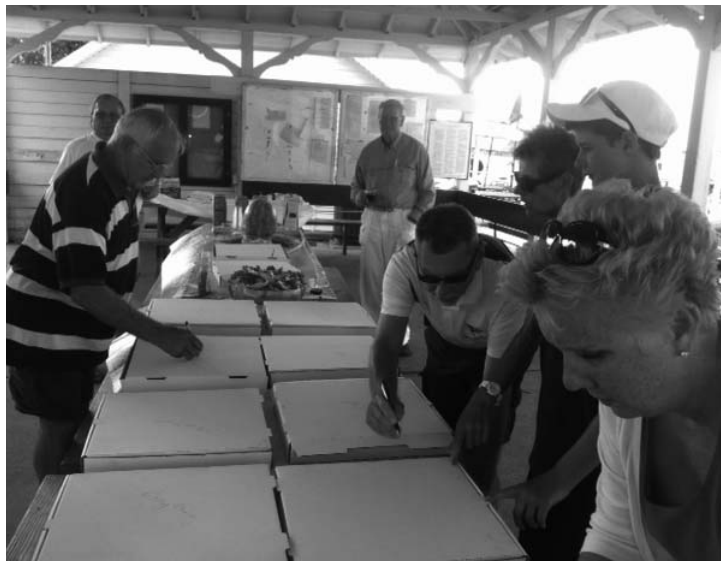
Pizza boxes being readied for members, by members, during Junior Bay Week. Thanks to every one who supported "our" kids ... before and during the event.