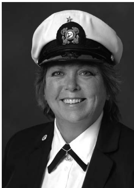
Commodore Gayle Fisher-Mulvey