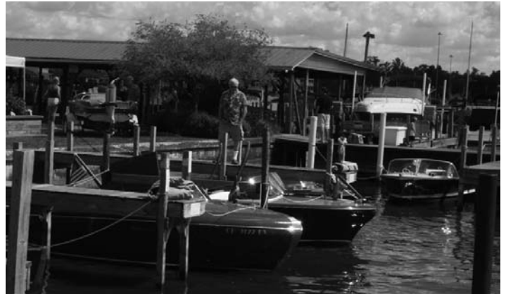
Antique Boat Show