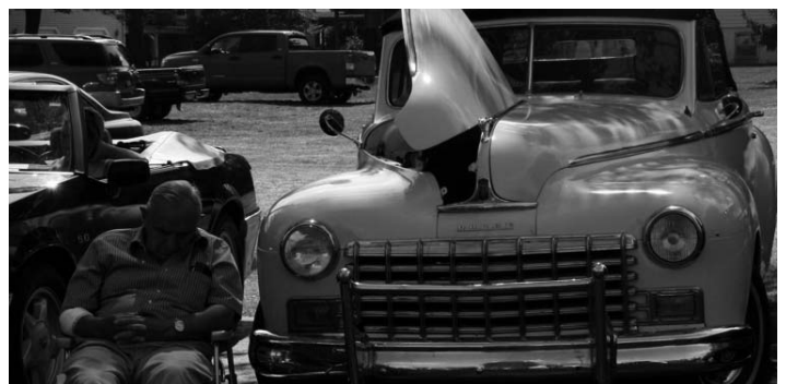
Car Show too