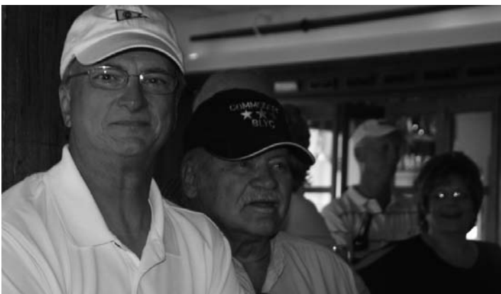
Annual Meeting attendees