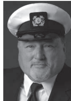
Governor Jerry Besanceney

protruding from out side the sea wall. Boat busters!