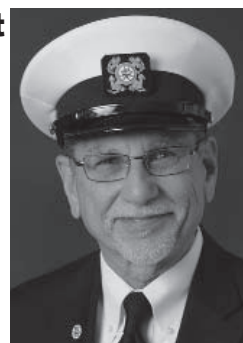
Governor Dave Luttenberger

Sunday 9/15/13 - (8:00-12:00) Election! No matter what, you must come out and vote. This is your chance to shape the tenor, tone and future direction of the Club.