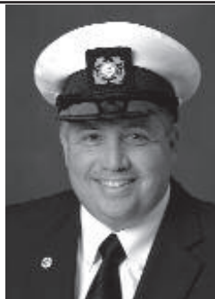
Governor Jeff Lyons

Please join me in welcoming the following new members at BLYC: