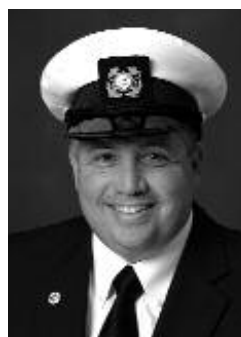
Governor Jeff Lyons

Please join me in welcoming the following new members at BLYC: