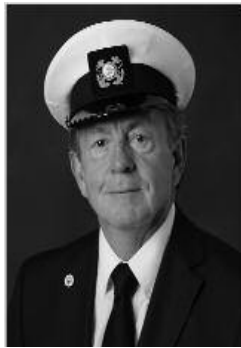
Governor Dave Lawrence

A Dock: a gateway from land to water. The Club has plenty of "gateways" to rent for the 2014 summer boating season.