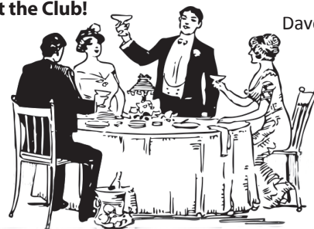
Dave Lawrence Bar & Kitchen