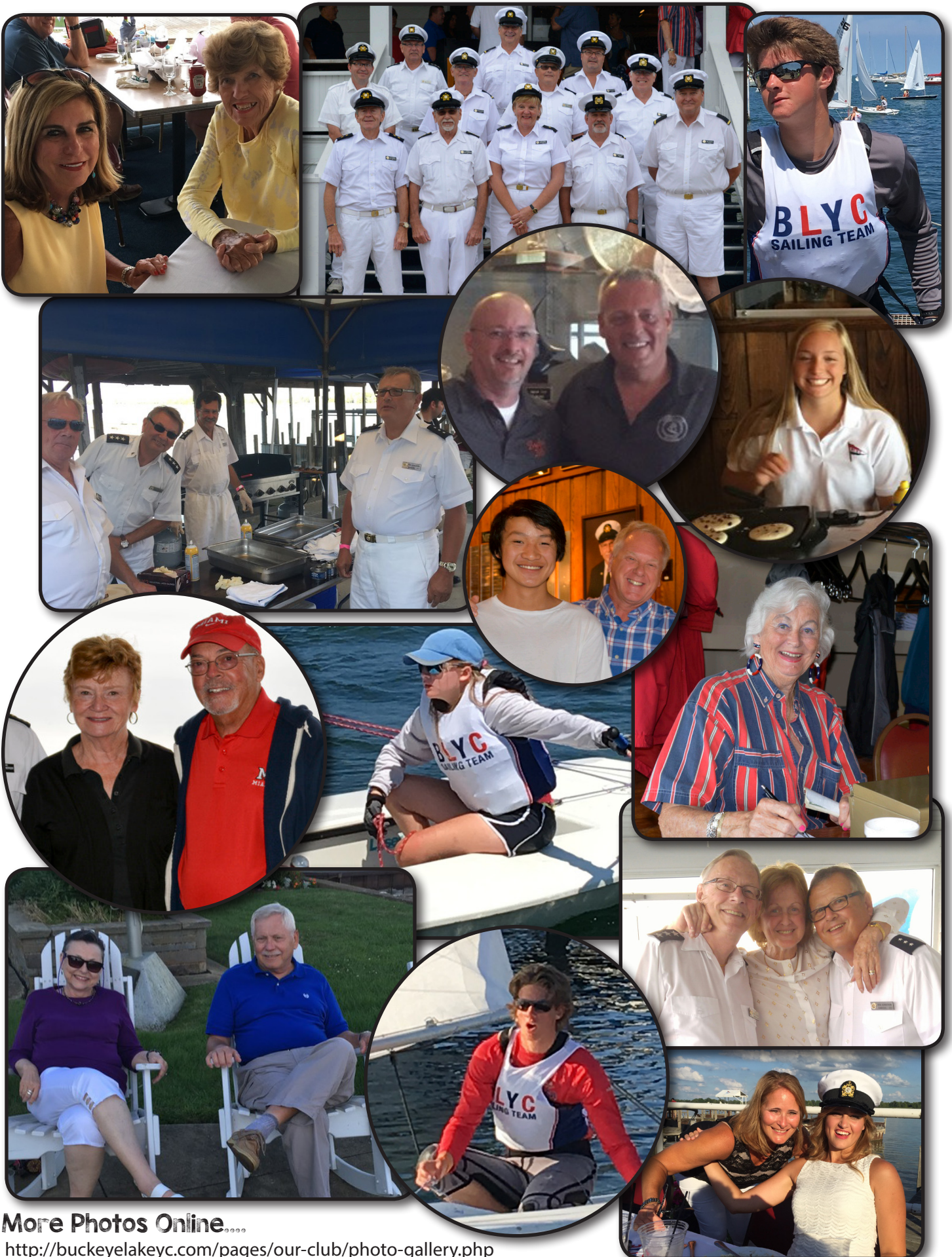
More Photos Online..... http://buckeyelakekeyc.com/pages/our-club/photo-gallery.php