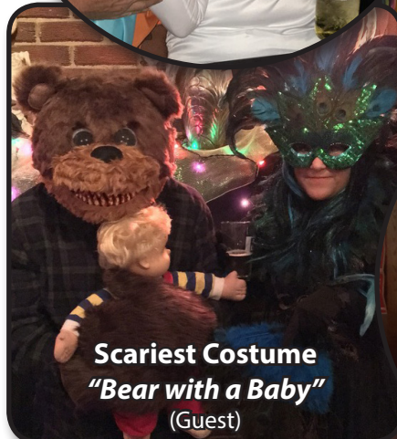
Scariest Costume "Bear with a Baby" (Guest)