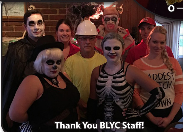
Thank You BLYC Staff!