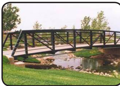
"Example Bridge" from ODNR

We have been busy talking with ODNR about the dam remediation and plans for the permanent bridge to our island and our dock access. The State has provided details and a picture of an "example bridge" like that they will be installing (at their cost) to the Club. The pedestrian bridge will be constructed with weathering steel — 30 foot span, 8 foot, 2 inches wide — with wood decking.