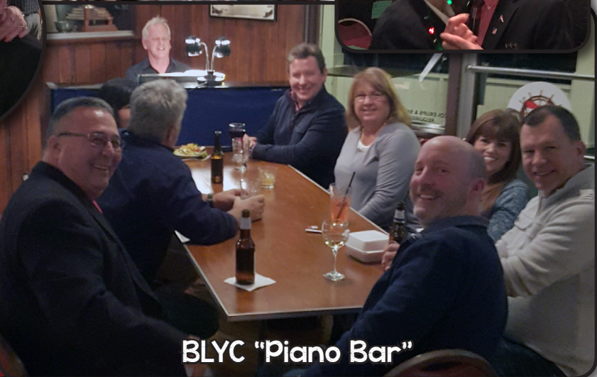
BLYC "Piano Bar"