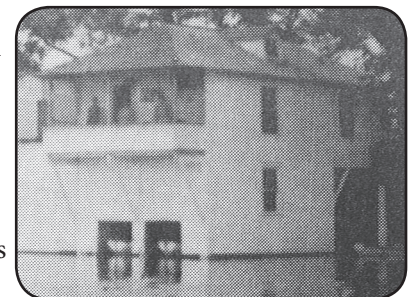
The Original Sayre Marina - 1905