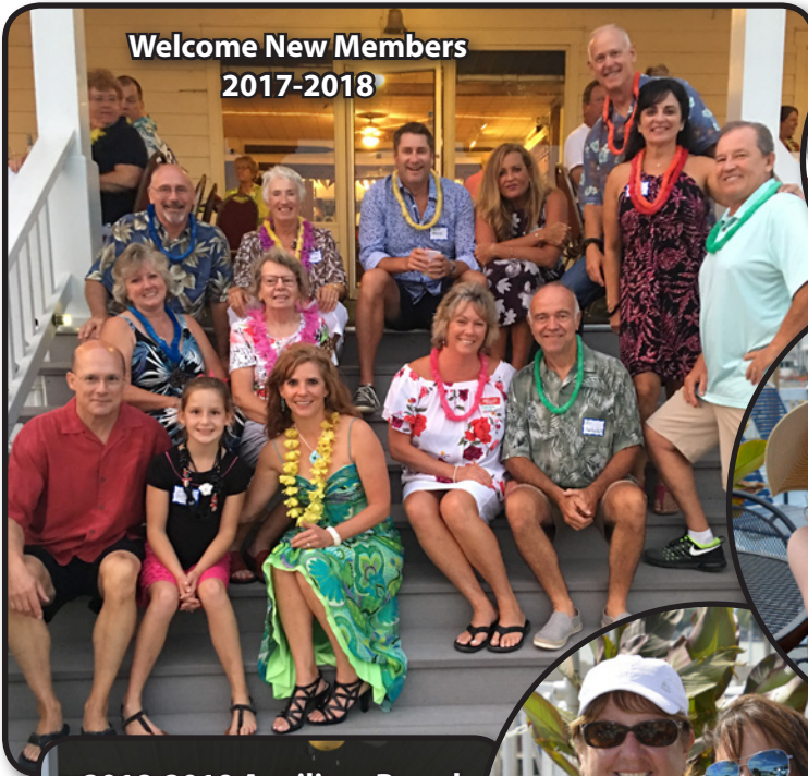
Welcome New Members 2017-2018