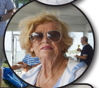
2018-2019 Board of Governors