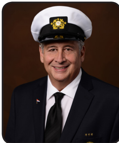
COMMODORE DONALD DICK