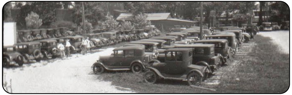
An early photograph of the BLYC Parking Lot — Parking cost 10 ¢