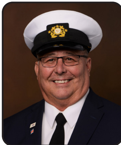
COMMODORE BRUCE AMES