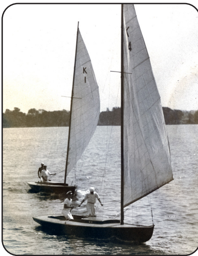
K boats on Buckeye Lake

The first Luedke K cat-boat raced at Put-in-Bay during the annual I-LYA Regatta on July 19, 1906 — during BLYC's first year as a club. In December of that year, I-LYA adopted rules establishing 22-foot "K" cat-boats as the official one-design sailboat for all I-LYA races. The class was instantaneously popular, so much so that President Taft donated a cup to Toledo Yacht Club for the K-cat champion in 1909. TYC dominated the series for many years, but later lost the cup to Detroit Yacht Club in 1917. Six years later, TYC would win it back and, in order that TYC never lose it again, the Taft Cup was retired. It is now a trophy awarded to the first place finisher on the short course of TYC's annual Mills Trophy Race — an overnight, long distance race from Toledo to Put-in-Bay raced each June. K-boats were not just popular in the western basin of Lake Erie. They were hugely popular at BLYC as well. Many of the old sailing photos we have from the early days of the Club are those of K-boats. BLYC sailors were very active in the class, both here at home and at the I-LYA Regatta. For several decades, the K-boats were the dominant fleet throughout the region. But, as time passed and technology